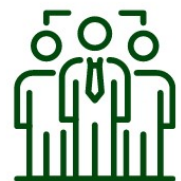
Family Business Planning

3 Valley Square, Ste 110 Blue Bell, PA 19422 T 610.650.1848 F 888.980.6768 IMWealthPartners.com