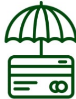
Asset Protection Strategies